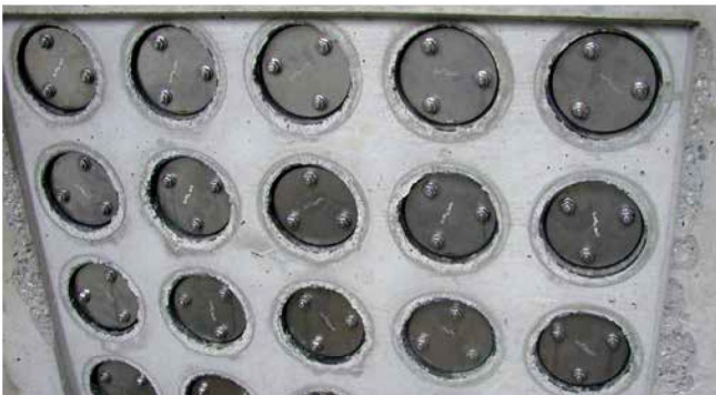
FZR100/240 – pipe section sealing