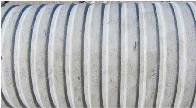
lengthwise watertight outer grooves