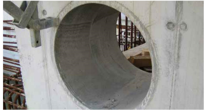
FZR400/300 – installation in water treatment plant