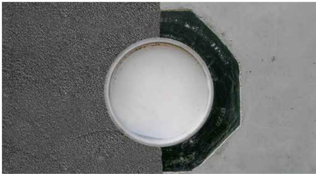
concreted UFR with PMBC