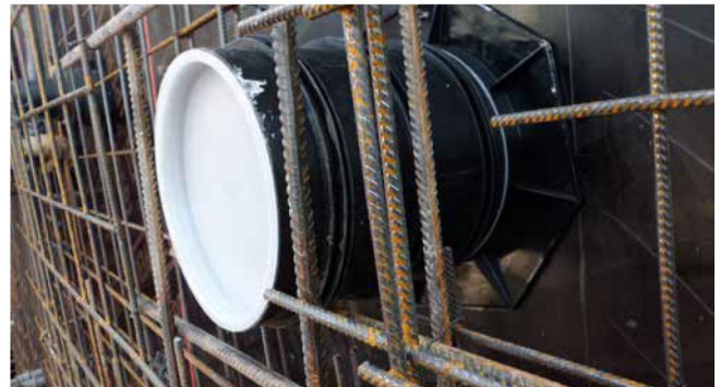
UFR in formwork