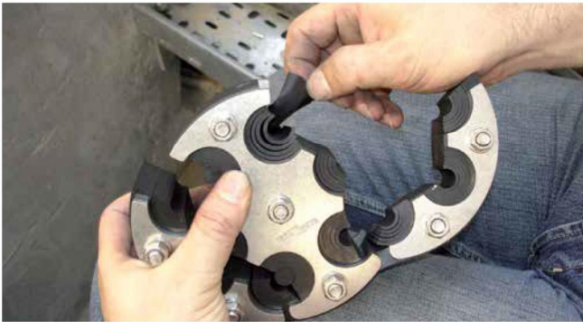
HRD150 SG 6x8-36 5 – individually adjustable to cable diameters