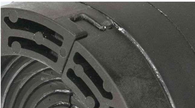
press plate with form-fitting connection