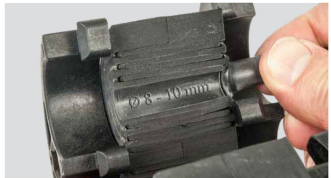
segments with exact diameter marking